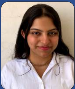
Shruti B.Voc (Cosm) Sem-VI