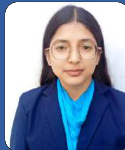
Taman B.Voc (BFS) Sem-IV