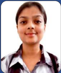
Ishu B.Voc (Cosm) Sem-IV