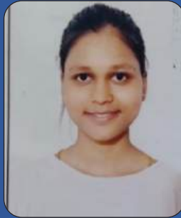
Vidhi BD Sem-II