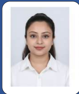
Palvi B.Voc (MHC) Sem-IV